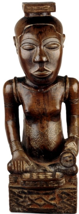
Ndop, Woodne carving of king ShyaamaMbul a Ngoong, Late 18 th Century.

“Wooden carvings were sometimes made of Kuba Kings after they had died. These wooden sculptures were not meant to look exactly like the King, but to show the king's spirit as a carving.” 6