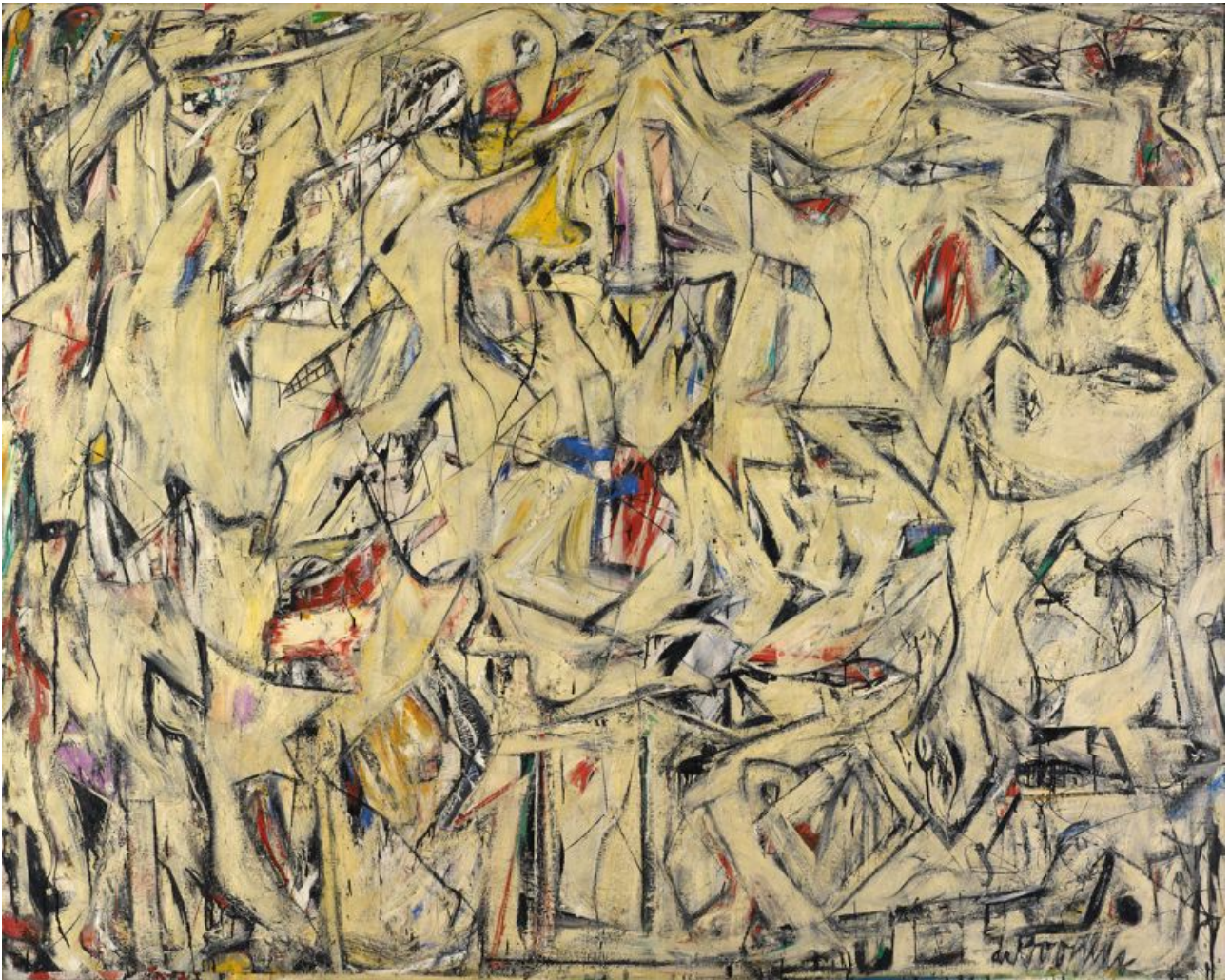
Willem de Kooning, American, born Netherlands, 1904-1997, Excavation, 1950

De Kooning is emphasising 'pure form' as the detachment from what is easily recognisable. De Kooning did not like people that labelled the abstraction as recognised forms of circles and squares. De Kooning wanted his art to mystify the viewer.