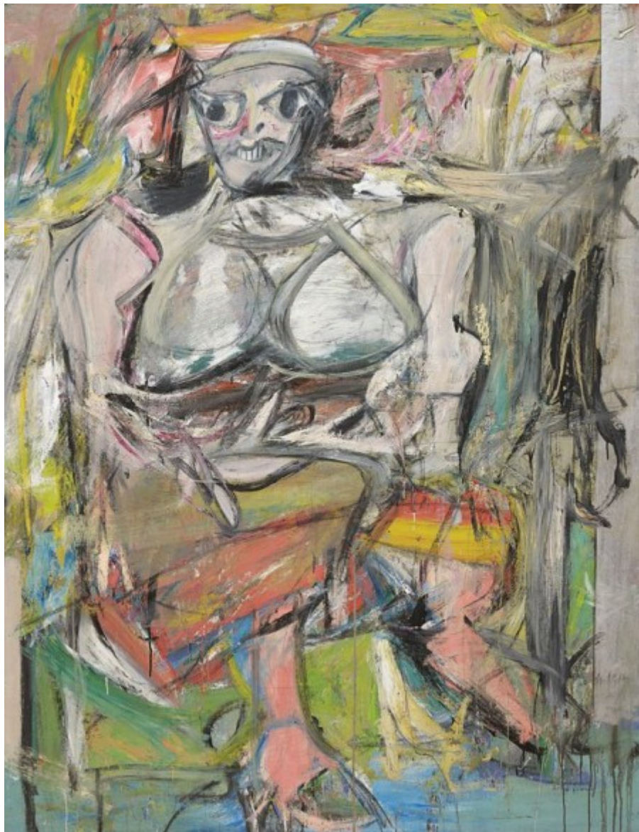
Willem de Kooning

'Excavation' was de Kooning's largest painting up to 1950. The painting is dominated by what de Kooning called Pure form , the non-representable forms. De Kooning gained inspiration from the film 'Bitter Rice', a 1949 Italian Neorealist film. "The mobile structure of hooked, calligraphic lines defines anatomical parts - bird, and fish shapes, human noses, eyes, teeth, necks and jaws - revealing the particular tension between abstraction and figuration that is inherent in de Kooning's work." 17