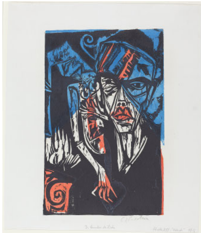
Ernst Ludwig Kirchner The Blond Painter Stirner (Blonder Maler Stirner), 1919

This colour woodcut shows an obscuring of linear perspective in the figure and composition. Kirchner's wide indentations made into the wood from where the print was made are quite similar to the non - naturalistic style of the Bambara ethnic group. The blue colour is fragmenting the background behind the figure and blending with the figures wide-opened eye.