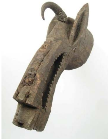
Mali Mask in the Segu Substyle of the Bambara.

There are many ethnic groups in which African art can be divided into. Bambara is an ethnic group and each has its own style of art. Bambara carvings are less naturalistic and can take many different forms from Humans to Hipopotamus. “The complex symbolic system of Bambara is reflected in an abundant production, related to the ritual functions, and has variable aesthetic qualities.” 7